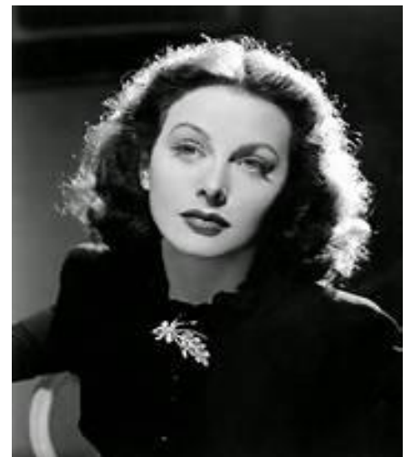
Hedy Lamarr The Mother of WIFI

HEDY LAMARR Hedy Lamarr was born Hedwig Eva Kiesler in Vienna, Austria in 1914. Most people know Hedy Lamarr as a top actress during Hollywood's golden era. She is less well known as a brilliant inventor. One of her inventions, with composer George Antheil, was a forerunner to today's Wi-Fi, Bluetooth, and GPS technologies, and has led many to dub Lamarr the mother of Wi-Fi. Lamarr invented a secret communications system during World War II to be able to radio control torpedoes, employing “frequency hopping” technology, which laid the tech foundations for everything from Wi-Fi to GPS. Hedy Lamarr had no formal training and was primarily self-taught, she invested her spare time, including on set between takes, in designing and drafting inventions, which included an improved traffic stoplight and a tablet that would dissolve in water to create a flavored carbonated drink.