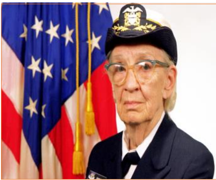
Dr. Grace Murray Hopper Invented Computer Software